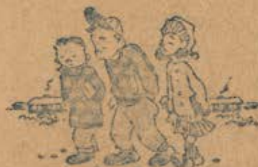
Going to School