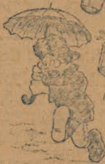
It rains by bucket-fuls.